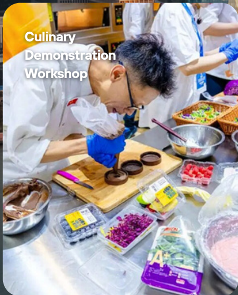
Culinary Demonstration Workshop