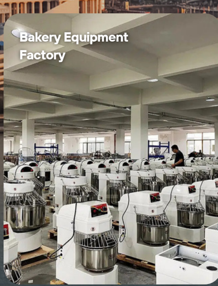
Bakery Equipment Factory